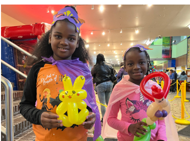
Children at the Family Fair

The Foundation continues to provide funding for the tremendously popular Museum Pass Program providing patrons with free or discounted admission to the area's most popular and expensive museums. Library patrons can now borrow passes for entry to 25 area museums, including MOMA, the New York Hall of Science, and the American Museum of Natural History. This year, NRPL passes enabled more than 12,000 museum visits!