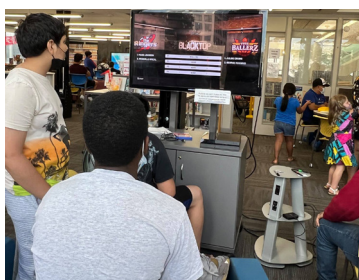
Teen Room during the Family Fair